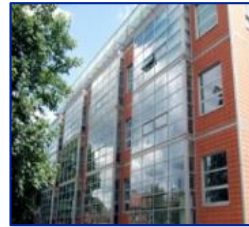
MSc London, UK