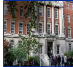
PhD London, UK