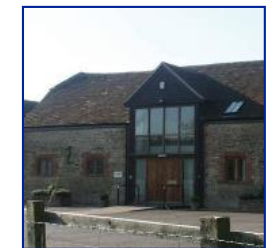
Trainee Medical Writer (2015)