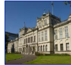
Post-doc Cardiff, UK