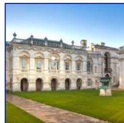
BA and PhD Cambridge, UK