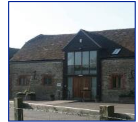
Associate Consultant (2014)