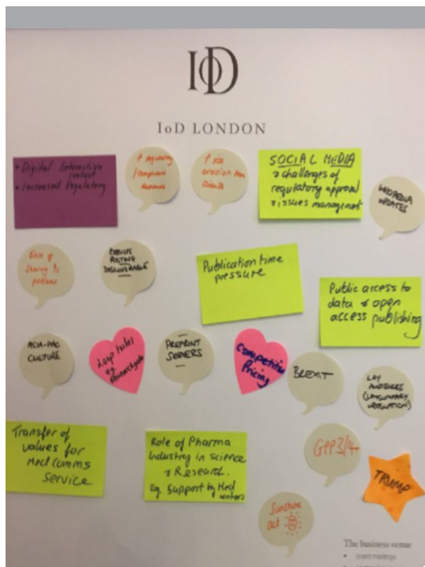
Build the Future Carousel Exercise

Rise of the smaller and specialist agencies (PR, Digital, Social Media, Video etc).